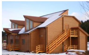
New Community Hall Stonehaugh

We'll let you know, in the Stonehaugh Newsletter of course, as soon as the website is up and running.